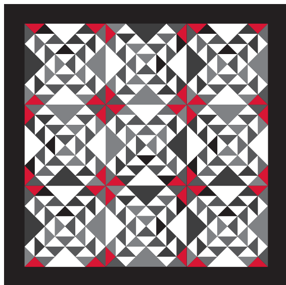
28" x 28" Quilt (includes 2"-wide borders)